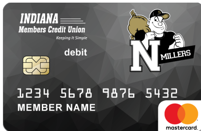
*Pictured is the Indiana Members Credit Union, Noblesville Millers debit card.