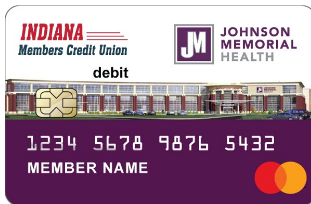
*Pictured is the Indiana Members Credit Union Johnson Memorial Health debit card.