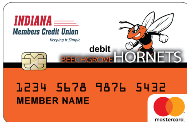
*Pictured is the Indiana Members Credit Union, Beech Grove Hornets debit card.