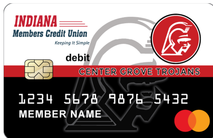
*Pictured is the Indiana Members Credit Union, Center Grove Trojans debit card.