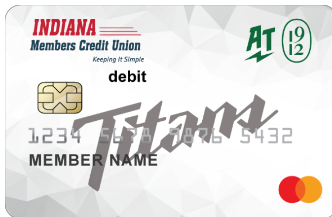
*Pictured is the Indiana Members Credit Union, Arsenal Tech Titans debit card.